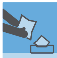
DRY HANDS WITH A CLEAN TOWEL OR AIR DRY YOUR HANDS