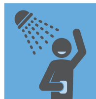
PRACTICE GOOD HYGIENE HABITS

For more information, visit: coronavirus.ohio.gov